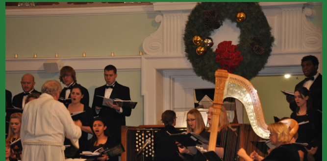
Festival of Lessons and Carols